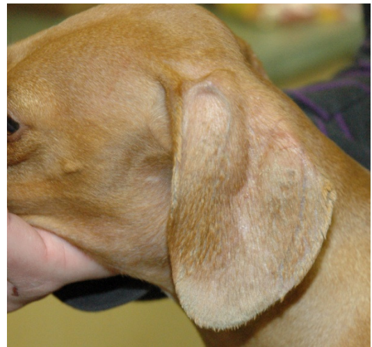
Another example of ear margin dermatitis showing the classic feature of localized hair loss on the ear of this dog.

The advanced stages of the disease with chronic splitting and damaged tissue may be resistant to medical therapy, and may require laser or surgical removal of the affected ear margin. 🐾