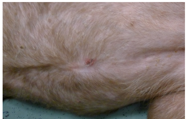
Image above: Patient a few weeks later after identification of disease and treatment. Note pustules have resolved and redness diminished. (Photo: Animal Dermatology Clinic)

Source: Colleen Mendelsohn, DVM, ACVD and Rusty Muse, DVM, ACVD