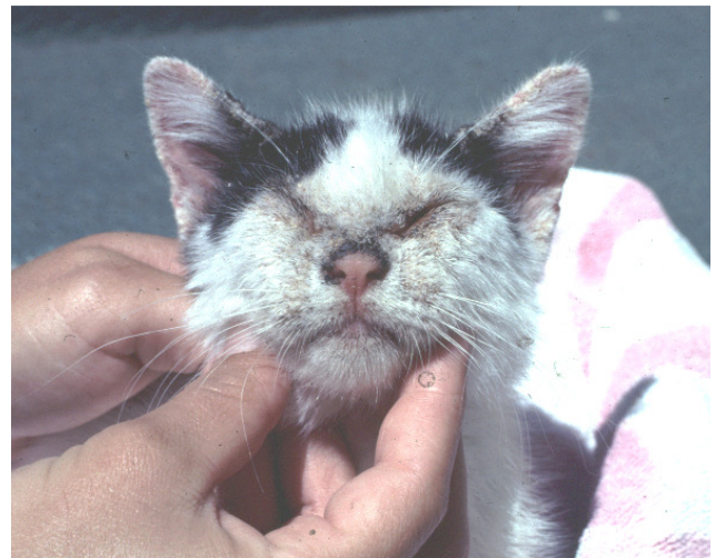
Cat affected by feline scabies.

Notoedric mange is caused by a parasitic mite ( Notoedres cati ) in cats. This is a contagious disease and spreads to other cats by direct contact so all cats in a household will be affected if one is carrying the mite.