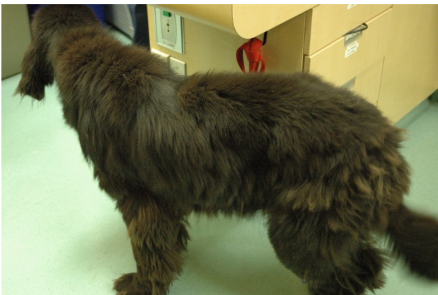
A patch of hair loss on the shoulder can be misdiagnosed as one many other similar appearing diseases. A TSH stimulation test revealed hypothyroidism in this dog.

Periodic blood tests are needed to monitor the dose of thyroid medication and dosage may be adjusted up or down depending upon the progression of the disease.