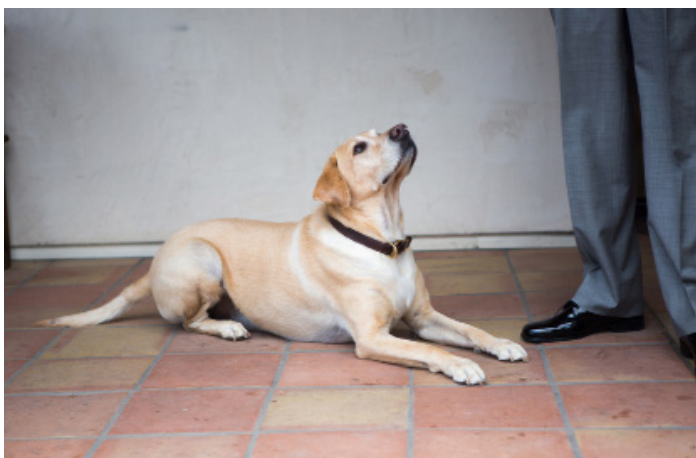
Cooper, a Labrador retriever, shown here waiting to participate as ring bearer at his owners' wedding in November 2014.