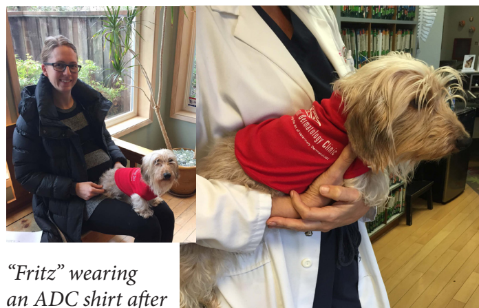
"Fritz" wearing an ADC shirt after his allergy skin test at the Portland, OR clinic.