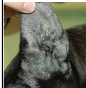
Top, an infection in Cushing's patient. Above, bacteria and Malassezia dermatitis.